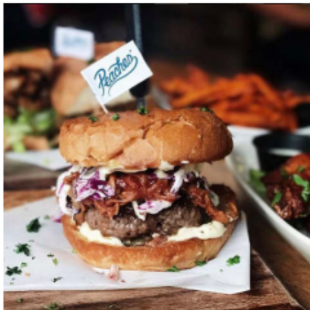
Mouthwatering sandwich

Get updates on where to find the truck next: Peaches's Truck schedule